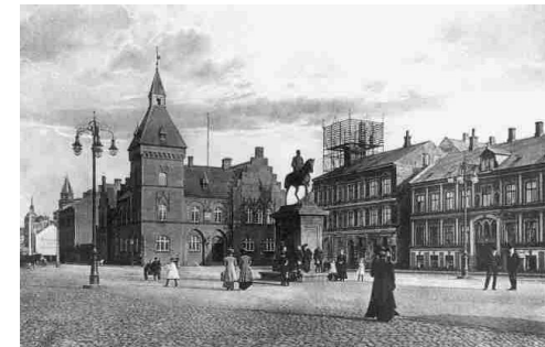
The displayed photograph has been lent by the Archive of Urban History. It shows the Market Square around the year 1900.

Note the different architectural styles of the buildings, e.g. C.H. Clausen's bank building at No. 18, which dates from 1896. It was a somewhat unusual bank building at the time it was built – an imitation of North Italian tiled Gothic. The town numbered 400 souls, most of whom lived in the two streets Havnegade and Smedegade. In 1875, apart from two two-storey houses, there were only single-storey houses in Esbjerg.